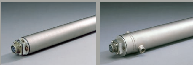
Scintillation Detectors: • 50 mm General Purpose Detector • 60 mm Water Cooled Detector Detectors Mount either Inside or External to the Mold Water Jacket