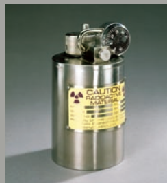
GS- 200/300 Point or Strip Source Holder with Internal Rotary Shutter. Mounts either External or Internal to Mold