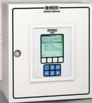
X96S Microprocessor in a Surface Mount Chassis Enclosed in a NEMA-4 Enclosure with a Panel Mounted Programmer and LCD Graphic Display