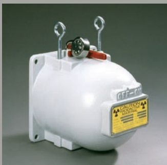
SA-1 Ductile Iron Point Source Holder with Internal Rotary Shutter. Mounts External to Mold

For mills where the user is already using gamma technology, Ronan offers a cost-effective solution to upgrade to this latest technology while utilizing existing sources, irrespective of original manufacturer. In cases where the user has a large inventory of detectors, solutions are available where those can still be used, thus increasing the cost-effectiveness of upgrading.