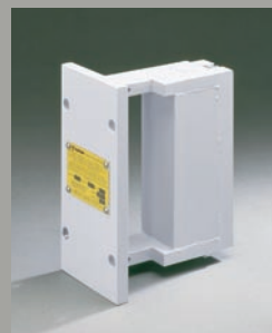
RLL-1 Low Level Source Holders with Shipping Shields: • Cartridge Style Side Insertion Mounting • Cartridge Style Top Loading Insertion Mounting • Fixed Inserted in Water Jacket Mounting